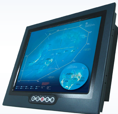
RuggedPC-17T 17" Sunlight Readable Industrial Panel PC