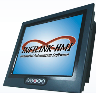
RuggedPC-15T 15" Sunlight Readable Industrial Panel PC

The Rugged PC Series is an industrial panel PC which combines our display technology with an Intel high performance CPU. The front is waterproof (IP65/ NEMA4) and features a high brightness display and special aluminum alloy casing. The Rugged PC Series is a cost effective PC and Display solution from the leaders in Outdoor Displays.